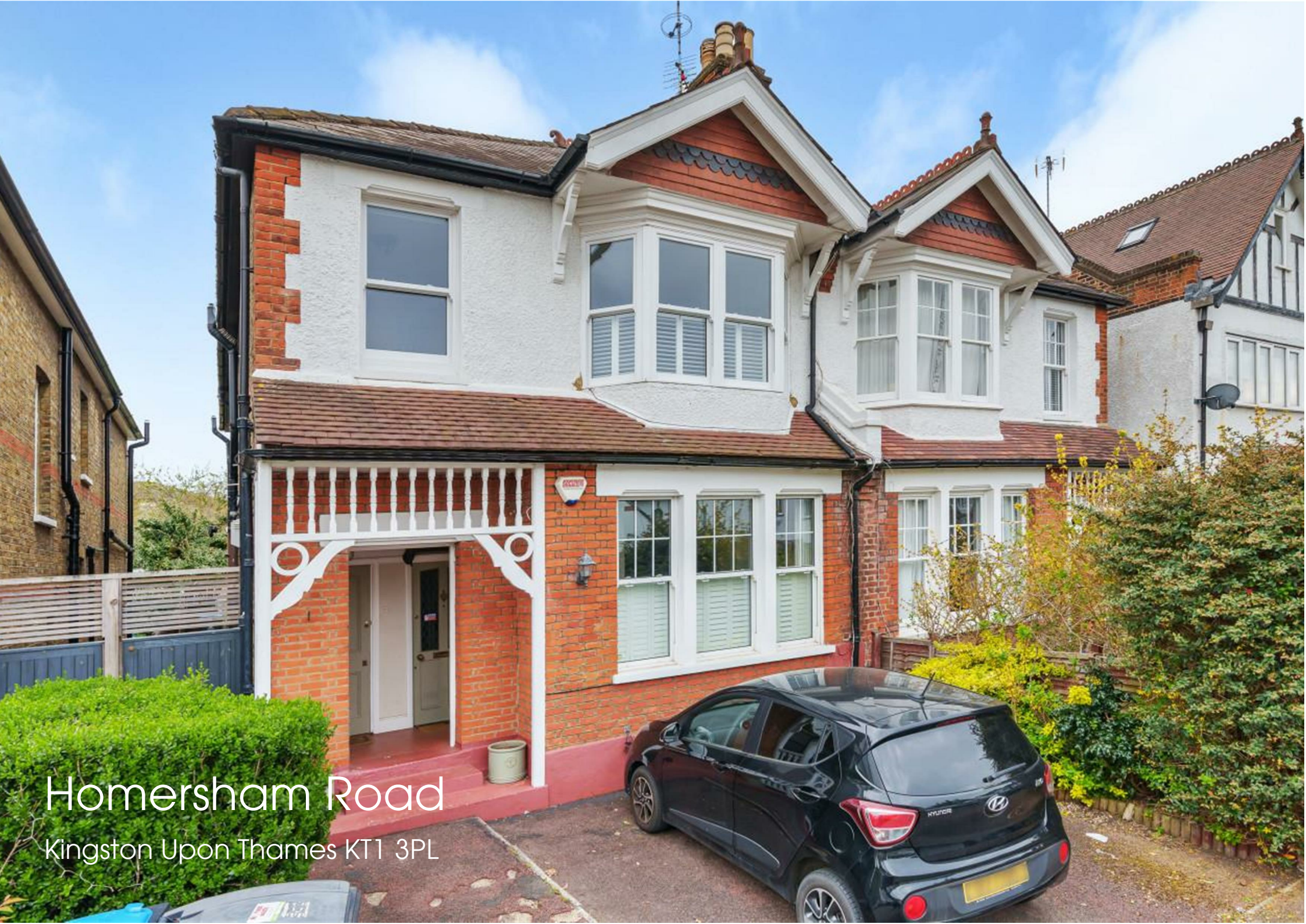
Homersham Road Kingston Upon Thames KT1 3PL